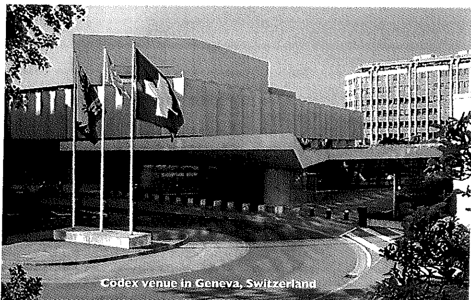
codex venue in Geneva, Switzerland

It happens every time. It happened with ractopamine, GMO labeling, melamine, and now rBGH. The countries and trade groups that want to make money off of some drug or food product will present their "science" showing how incredibly safe it is and how we would all be idiots if we didn't accept the product immediately. It is then up to us to show that they are wrong and that the science indeed shows health risks. If they are able to snag JECFA on their side, then they will also argue that Codex must not insult Codex and appear stupid for not following its own body's scientific risk assessment.